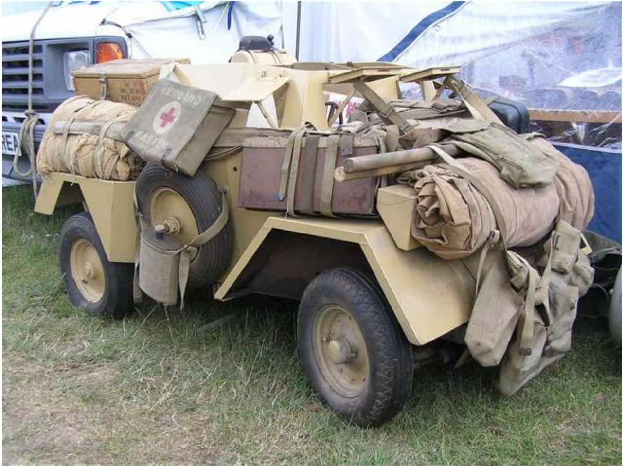
This 1/4 scale dingo model was built by Ivor Hodge of Kent for his son, its powered by a single cylinder one speed powered barrow engine and is of fully steel construction.