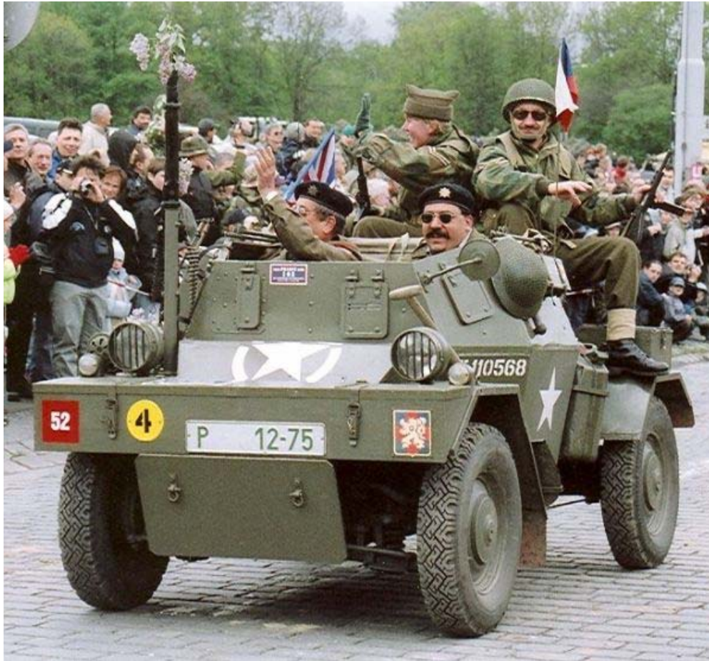
A photo of this Dingo replica was found on the web nothing is known about it!